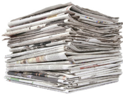
Newspaper (No Glossy Inserts)